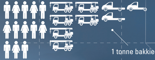
1 tonne bakkie

(since October 2017) Tankage Maintenance and Tankage Reconstruction 100% black owned and 50% female owned